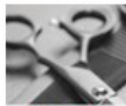
Walla Hair Salon